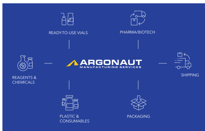
Figure 2. The DLT traceability trail encompasses the manufacturing ecosystem. Each ecosystem partner is permitted to add to the distributed ledger.

Closely aligned members within the pharmaceutical manufacturing workflow may find DLT advantageous even without an end-to-end solution. DLT solutions that provide transparency to supply chain issues such as smooth hand-offs, product quality, or cost reduction may be the most beneficial. As the problem that DLT will resolve is more defined in these cases, and there are fewer stakeholders needed for both trust and data definition, implementation may be faster and less expensive.